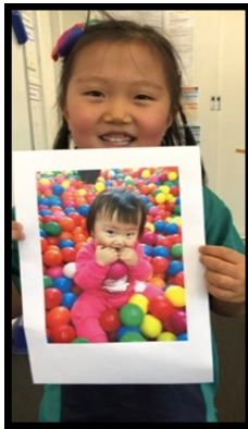
Do you recognise us from our baby photos?